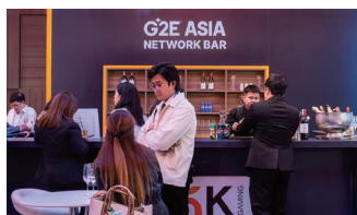
TABLE GAMES NETWORKING